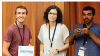
Student awards for IPFN researchers