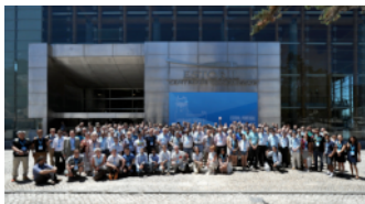
ICPIG 2017 - Estoril, July 9-14