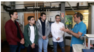
Young People with Energy workshop