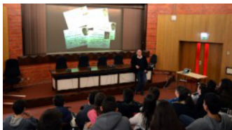
Nuclear Fusion at IST's Physics Week