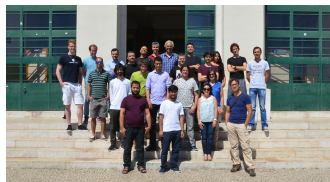
Workshop on Parallel Computing for Fusion