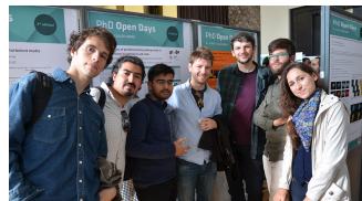
APPLAuSE students in Técnico PhD Open Days