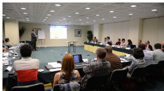
EUROfusion Goal Oriented Training